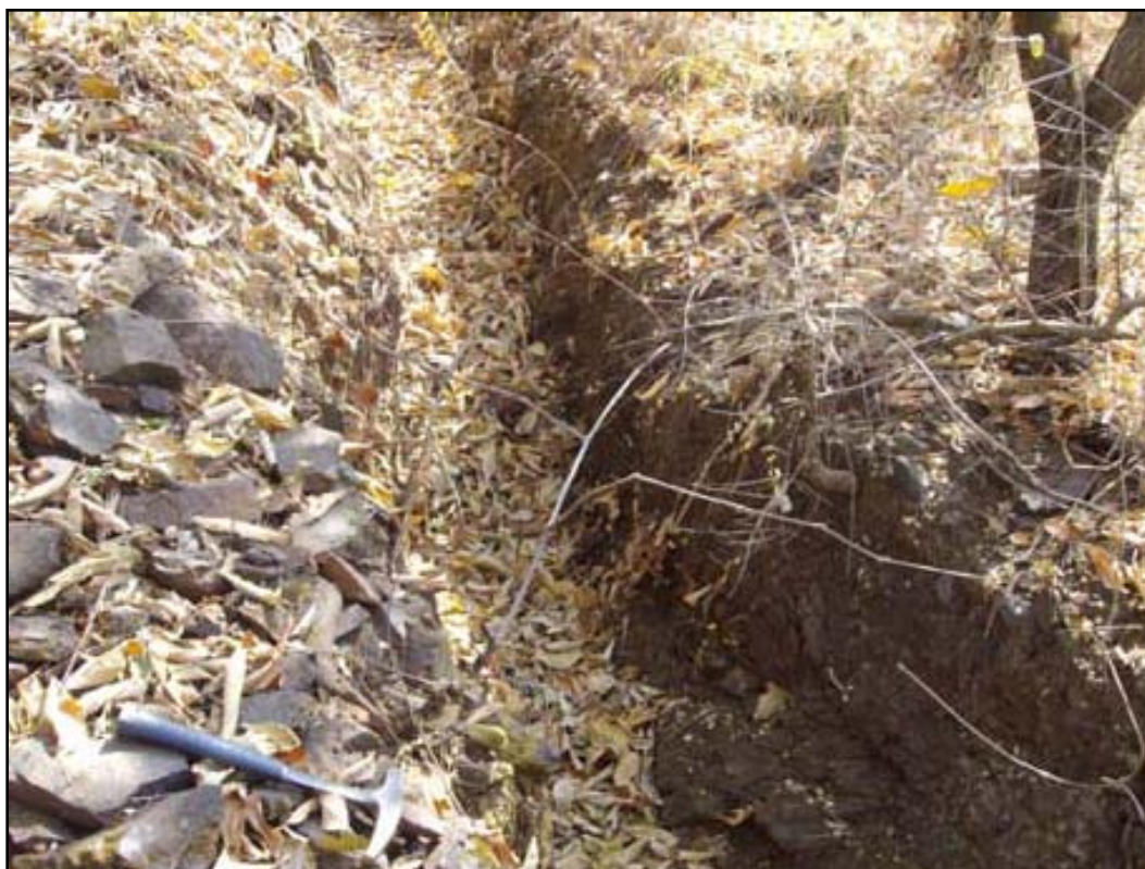
Plate-1 Apatite-Magnetite-Ilmenite Bearing Rock