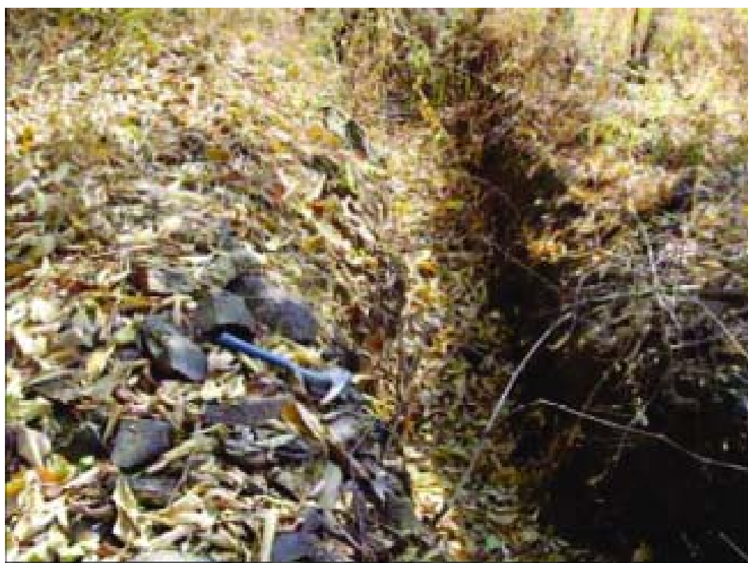
Plate-2 Excavation of Trenching on Phosphate Rock Area